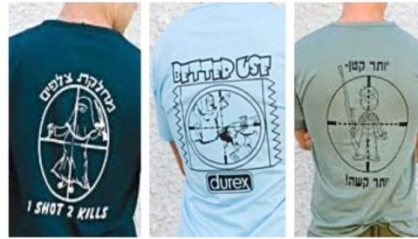
Figure 1: Israeli Soldiers' T-Shirts

literal and figurative targets. I argue that such cultural reproductions of violence become mediums where militarization is normalized. Pregnancy, from the position of the military soldier, becomes a literal target whereby deliberate violence against one Palestinian woman yields the death of many more Palestinians to come.