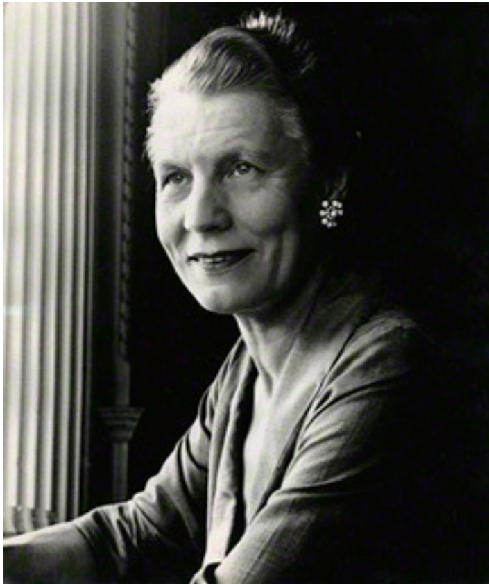
Dr Edith Summerskill