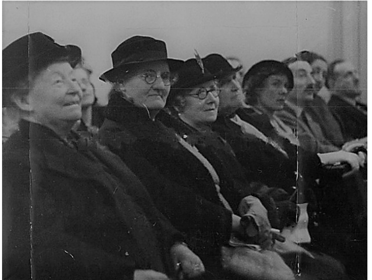
Meeting of Married Women's Association

‘Our objects are to promote legislation to create a legal equal financial partnership in marriage ...’