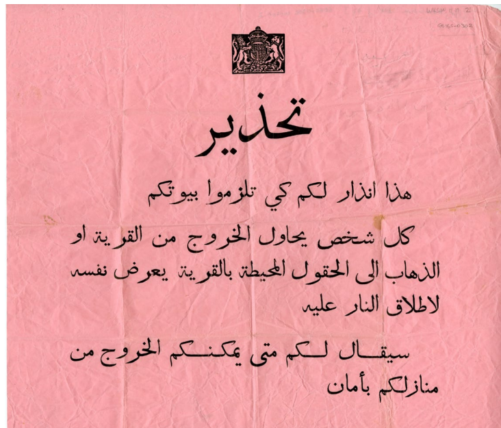
Figure 1. Curfew Notice, 1939. Arabic curfew notice that was dropped by airplane. The writing states “This is a warning to you to keep indoors. Any person who tries to leave the village, or to go to the fields surrounding the village, is liable to be shot. You will be told when you may safely leave your houses.”